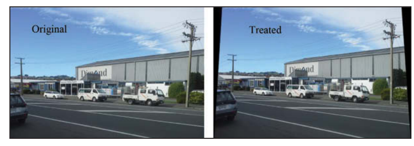
Fig. 5: Correction for camera pitch.