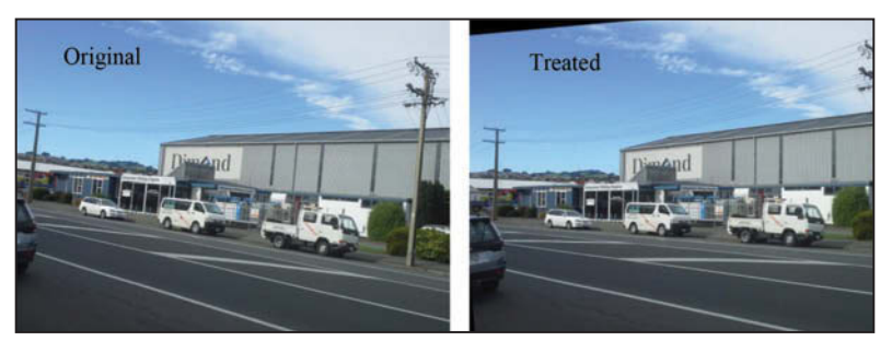
Fig. 4: Correction for camera roll.