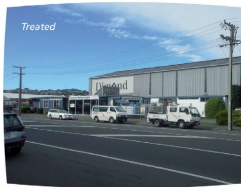
Figure 3 Correction for lens distortion