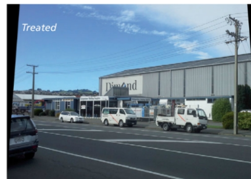
Figure 5 Correction for camera pitch