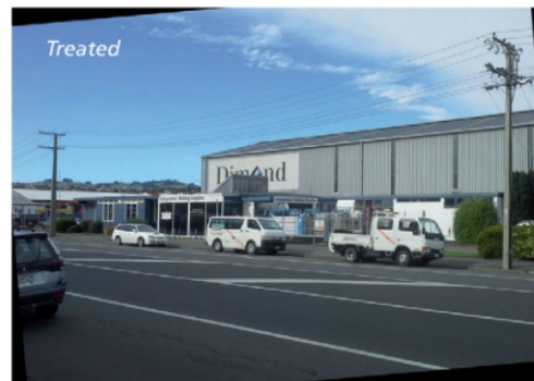
Figure 4 Correction for camera roll